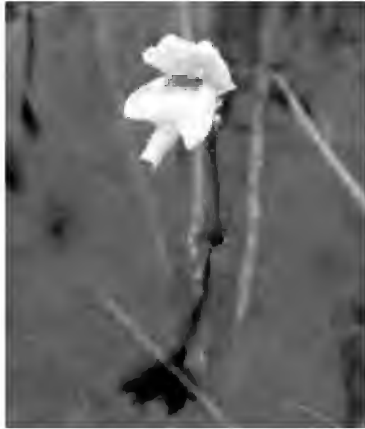
Figure 3. Purple bladderwort ( Utricularia purpurea ) at Sandy Pond.

stand of dangleberry. A deluge of rain was a perfect deterrent for ticks and biting insects, but didn't hamper our exploration of the pond-shore and shallow water, where we encountered a blaze of colour—mostly yellow and green, but with smatterings of rust, pink, magenta, pale lilac and red. I was thrilled to make a few more new botanical friends, including late yellow-eyed